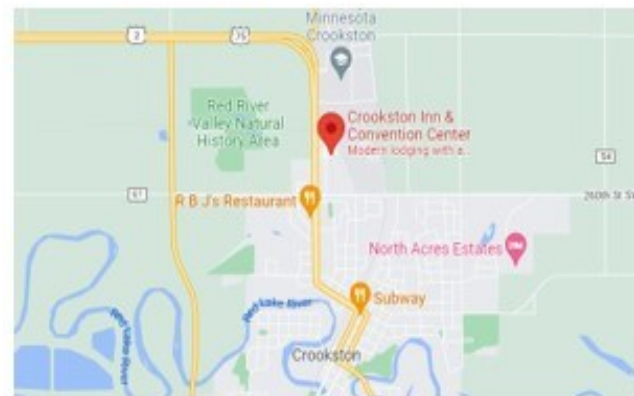
All DCMs, GSRs, Area Officers and Committee Chairs, Delegate, Alternate Delegate and Past Delegates are encouraged to attend as well as all others interested in carrying the message to the still suffering alcoholic. The only requirement is a willingness to serve.

Sunday, April 7 9:00 AM Assembly Reconvenes